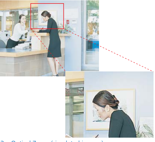
3 x Optical Zoom (simulated images)

The SNC-P5 is pan/tilt-capable with both a pan and tilt range of 75 degrees allowing users to monitor a relatively wide viewing area with a single camera. What's more, the SNC-P5 employs a 3x optical zoom lens, enabling users to zoom in on small or distant objects with clarity.